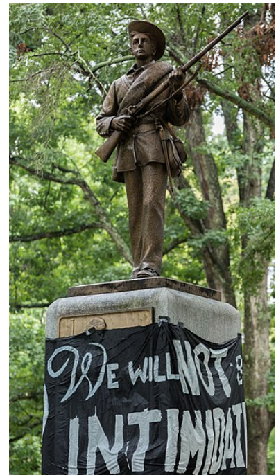
Figure 3: Protests against Confederate monuments like this one at UNC-Chapel Hill have proliferated in the last three years.

Weeks 4-9 In Part 2, we will turn to three questions that are currently the subjects of active public debate in the United States: (a) is illegal immigration on the rise, requiring an increase in border security? (b) are American elections today more threatened by voter suppression or voter fraud? (c) should Confederate monuments be allowed to remain in public spaces? We will spend about two weeks each on these three questions, working backwards from the present to consider what role historical thinking can play in answering them.