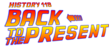
Figure 2: No DeLorean needed.

I also have intentionally said that we will be doing this, because I will also be doing many of the writing assignments I give to you. Much like your math or chemistry professor tries to demonstrate how to solve problems by working them herself, I'm going to work alongside you and share how I think about our common task.