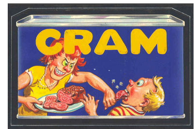
Figure 1: The opposite of what I want to do.